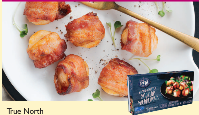
True North Bacon Wrapped Scallop Medallions 8 oz, Frozen