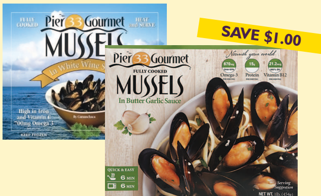
Pier 33 Fully Cooked Gourmet Mussels 16 oz, Selected Varieties