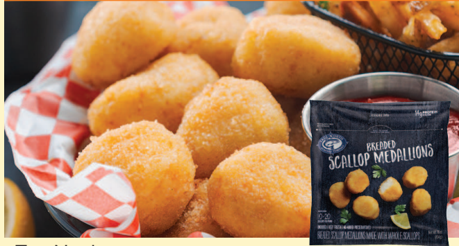
True North Breaded Patagonian Scallops 16 oz, Frozen